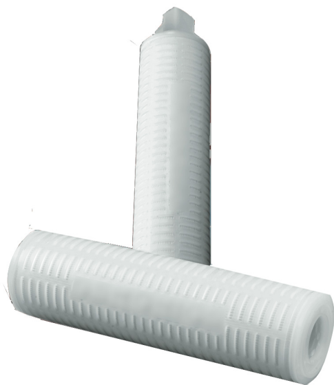
Figure 1: Flotrex PN Filters