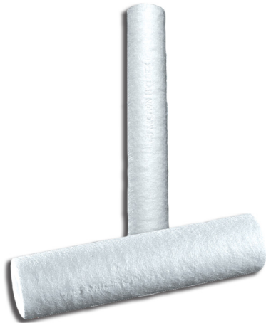
Figure 1: Hytrex Depth Cartridge Filters