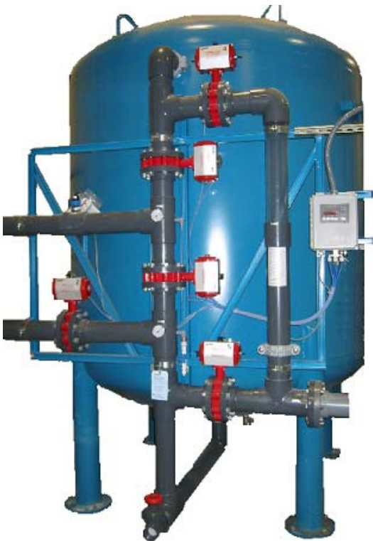
Figure 1. PRO Series Flow Range